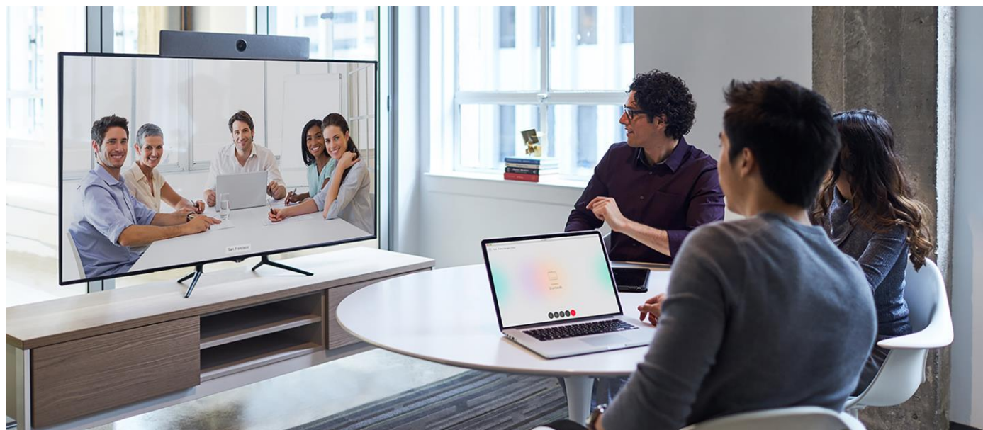
Figure 1. Cisco Spark Room Kit in small room scenario

The Room Kit – which includes camera, codec, speakers, and microphones integrated in a single device – is ideal for rooms that seat up to seven people. It offers sophisticated camera technologies that bring speaker-tracking capabilities to smaller rooms. The product is rich in functionality and experience but is priced and designed to be easily scalable to all of your small conference rooms and spaces – whether registered on the premises or to Cisco Spark through the Cisco® Collaboration Cloud.