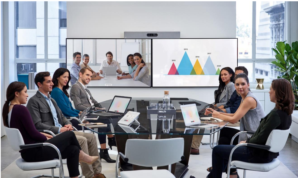
Figure 1. Cisco Spark Room Kit Plus in Large Conference Room

The Room Kit Plus – comprising a powerful codec and a quad-camera bar with integrated speakers and microphones* – is ideal for rooms that seat up to 14 people. It offers sophisticated camera technologies that bring speaker-tracking and auto-framing capabilities to medium to large-sized rooms. The product is rich in functionality and experience but is priced and designed to be easily scalable to all of your conference rooms and spaces – whether registered on the premises or to Cisco Spark through the Cisco® Collaboration Cloud.